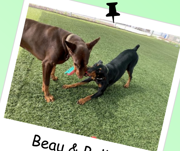
Beau & Belle